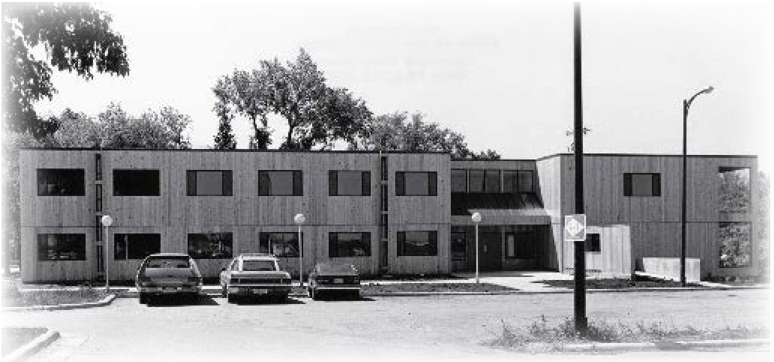
505 Princeton c.1974