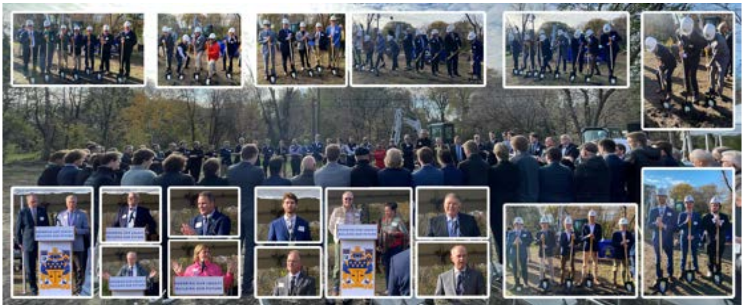
Pictures Taken at the Groundbreaking Ceremony

Delta Upsilon fraternity at UND turns 60 this year, and the celebration was held over homecoming weekend in Grand Forks. The events kicked off on a cool, sunny Friday afternoon in October with the groundbreaking of Delta Upsilon's new, $6.1 million chapter house, to be located at 421 Princeton Street. Other activities included alumni and students participating in UND homecoming events, and a campaign kickoff banquet and 60th Anniversary Celebration on Saturday night at the Alerus Center in Grand Forks.